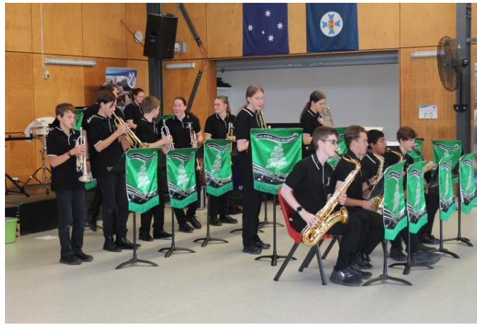
Stage Band on the Primary Schools Tour