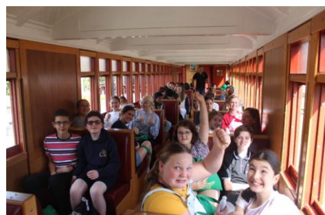
Hervey Bay Performing Arts Tour