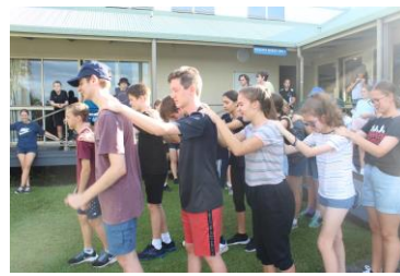
Music Camp at Maroochy River