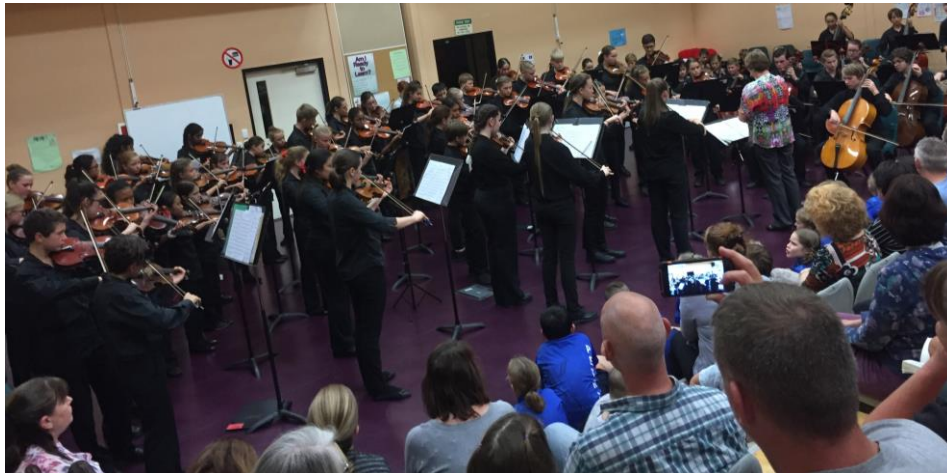
Stringfest – collaborating with other schools' string ensembles