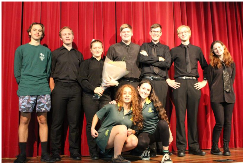
2021 Year 12 Instrumental Music Students