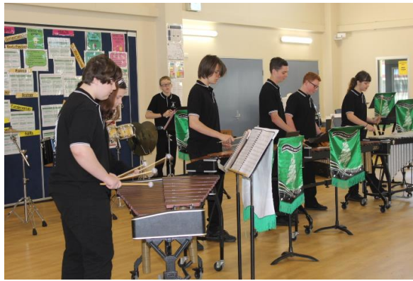
Percussion Ensemble on the Primary Tour