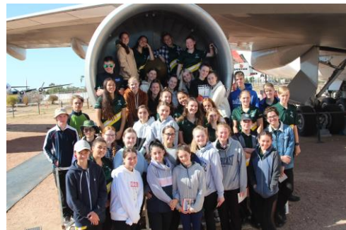
Music tour of Outback QLD