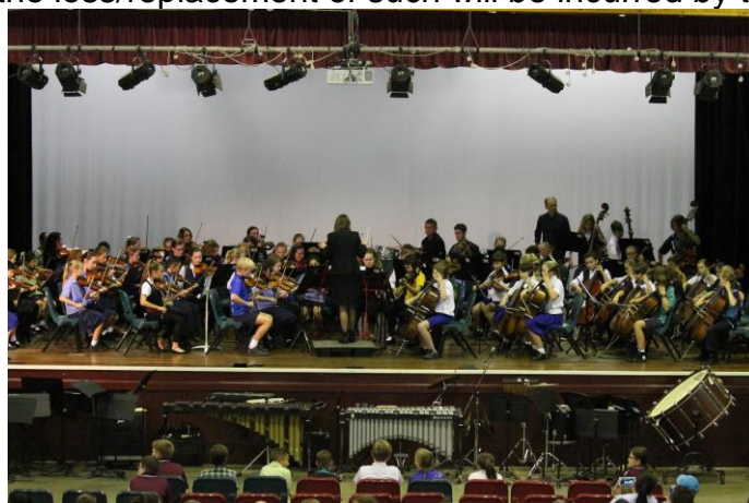
Primary Advanced Music Workshop Concert in Pine Rivers School Hall