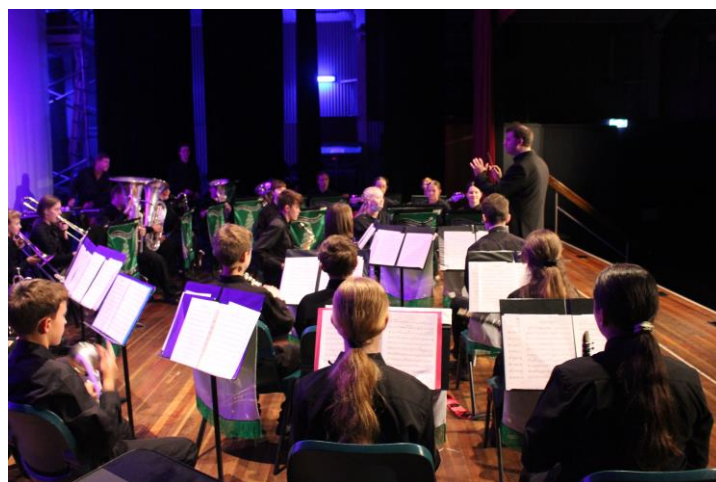
Concert band performing at Gala Night