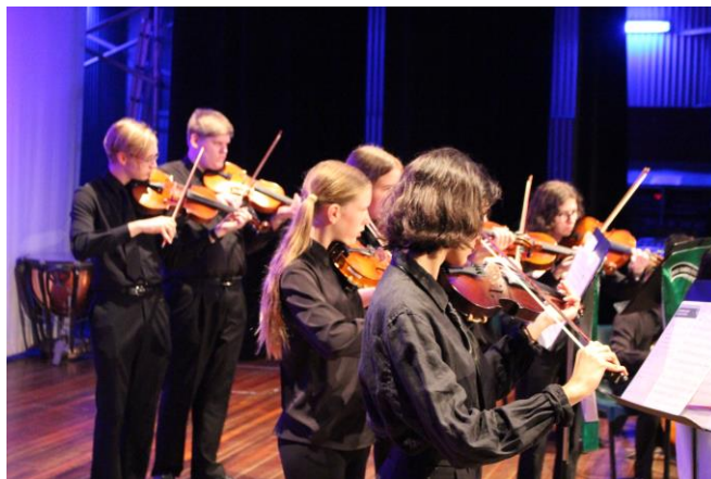
String Ensemble at the Gala Night