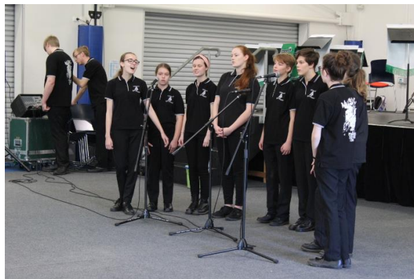
The Pine Voices on the primary schools tour