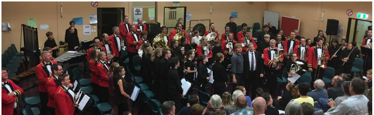
Performing with Award Winning Brisbane Excelsior Band