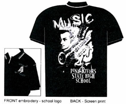
FRONT embroidery - school logo BACK - Screen print

Students are expected to purchase a black polo shirt endorsed by the PRIMA Committee as part of their uniform. Students will be able to wear this shirt to and from performances as well as at some performances e.g. tours and casual performances – a practical alternative to their more formal black performance outfit at assemblies and competitions. Parents are also welcome to purchase a shirt too, particularly to wear if volunteering with PRIMA.